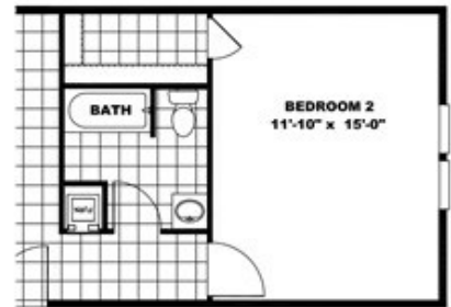
OPTION 2 BEDROOM

Our home building facilities invest in continuous product and process improvements. Plans, dimensions, features, materials, specifications and availability are subject to change without notice or obligation. Renderings and floor plans are representative likenesses of our homes and may differ from the actual homes. We invite you to tour a Home Center near you and inspect the highest value in quality housing available or call (205) 663-3730 to speak with a Home Consultant. Copyright 2017, CMH. All rights reserved.